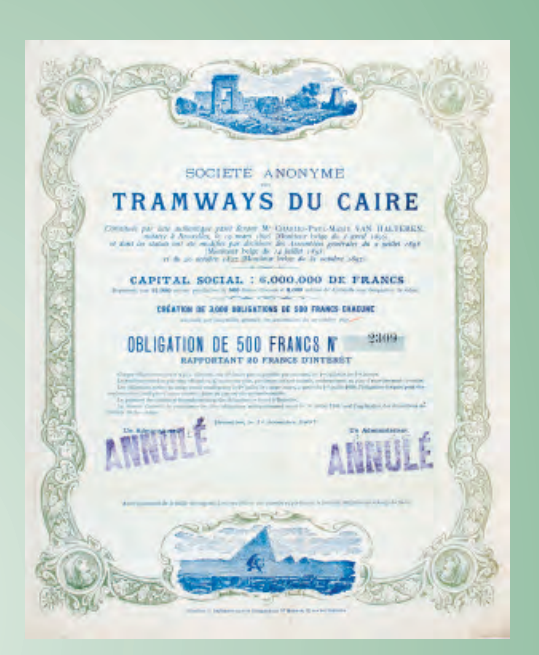
Edouard Empain in Egypt